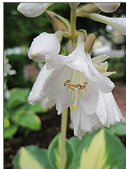
Dream Weaver Hosta flowers