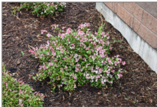
Yuki Kabuki Deutzia in bloom