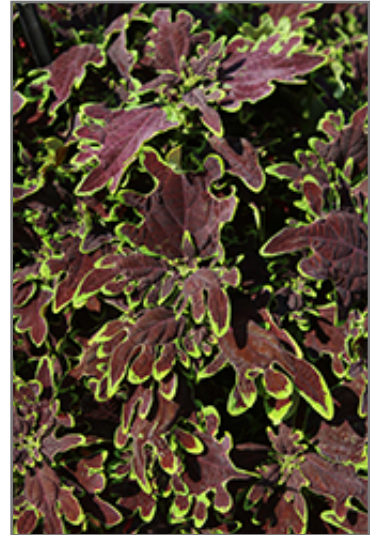
Limewire Coleus foliage