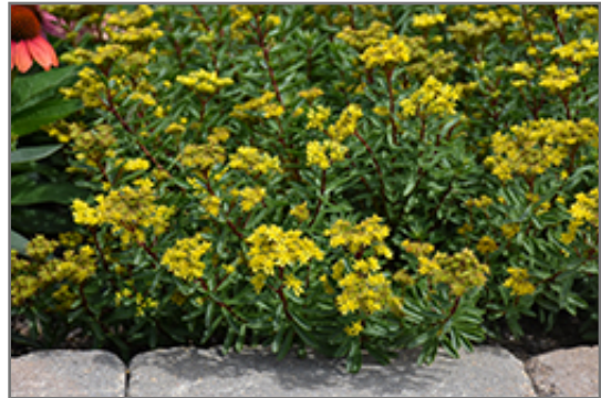
Yellow Diamonds Stonecrop flowers