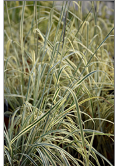
Shining Star Bluestem foliage

Shining Star Bluestem is recommended for the following landscape applications;