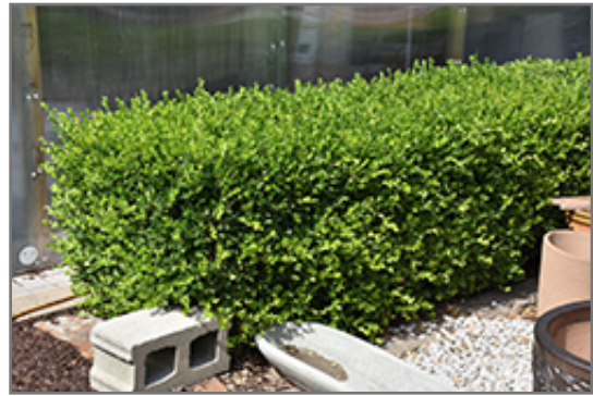
NewGen Independence Boxwood