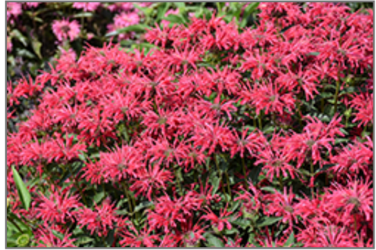
Upscale Red Velvet Beebalm flowers

Upscale Red Velvet Beebalm is an herbaceous perennial with a mounded form. Its medium texture blends into the garden, but can always be balanced by a couple of finer or coarser plants for an effective composition.