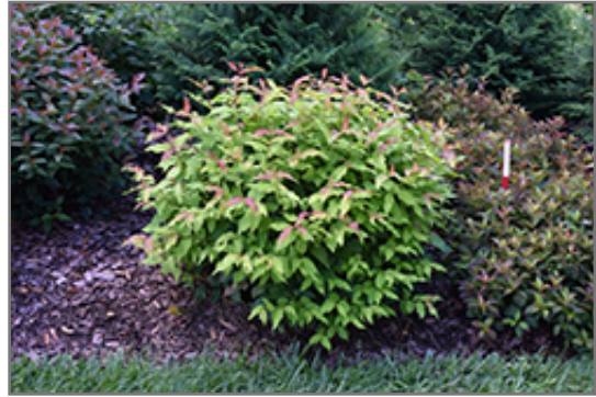
Kodiak Fresh Diervilla