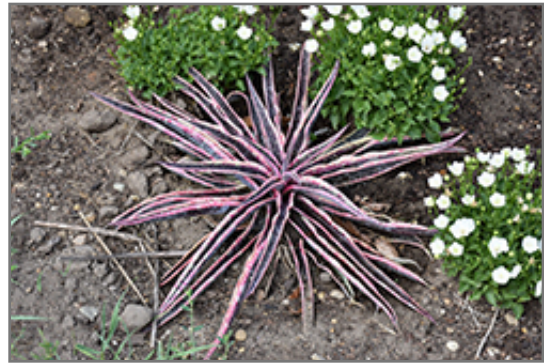
Art Deco Mangave