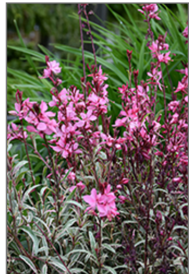
Gambit Variegata Rose Gaura flowers