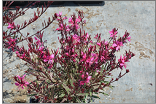
Gambit Variegata Rose Gaura in bloom