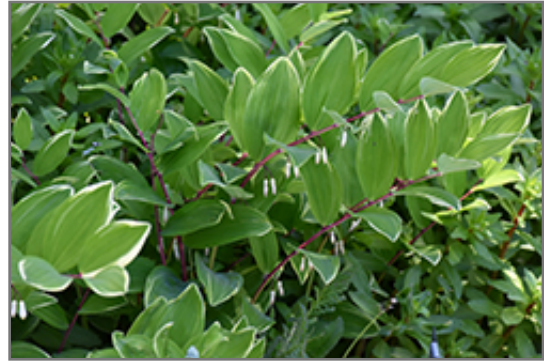
Variegated Solomon's Seal flowers