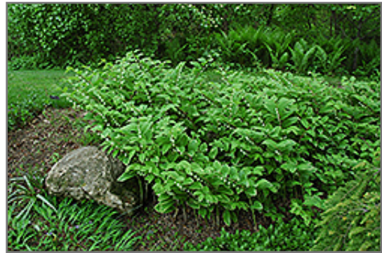
Variegated Solomon's Seal in bloom