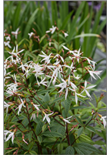
Bowman's Root flowers

This plant will require occasional maintenance and upkeep, and should be cut back in late fall in preparation for winter. It is a good choice for attracting bees and butterflies to your yard. It has no significant negative characteristics.