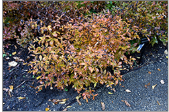
Bowman's Root in fall

Bowman's Root will grow to be about 30 inches tall at maturity, with a spread of 24 inches. Its foliage tends to remain dense right to the ground, not requiring facer plants in front. It grows at a medium rate, and under ideal conditions can be expected to live for approximately 10 years. As an herbaceous perennial, this plant will usually die back to the crown each winter, and will regrow from the base each spring. Be careful not to disturb the crown in late winter when it may not be readily seen!