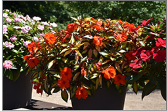
SunPatiens Vigorous Tropical Orange New Guinea Impatiens in bloom

SunPatiens Vigorous Tropical Orange New Guinea Impatiens is a fine choice for the garden, but it is also a good selection for planting in outdoor containers and hanging baskets. Because of its height, it is often used as a 'thriller' in the 'spiller-thriller-filler' container combination; plant it near the center of the pot, surrounded by smaller plants and those that spill over the edges. It is even sizeable enough that it can be grown alone in a suitable container. Note that when growing plants in outdoor containers and baskets, they may require more frequent waterings than they would in the yard or garden.