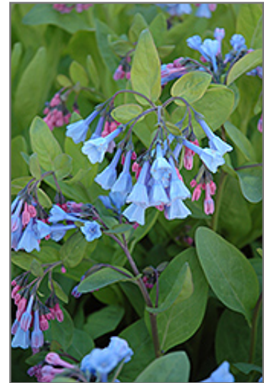
Virginia Bluebells flowers