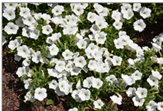
Supertunia Vista Snowdrift Petunia flowers