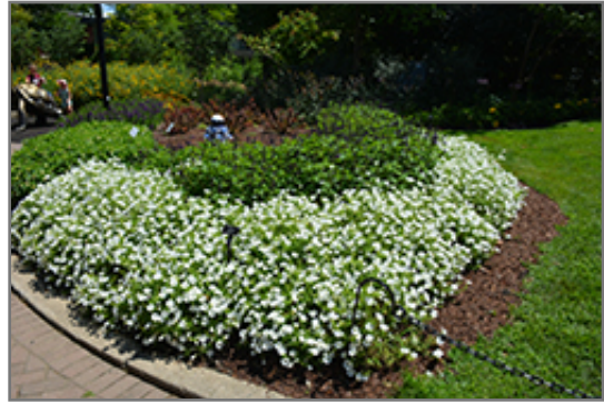
Supertunia Vista Snowdrift Petunia in bloom

Supertunia Vista Snowdrift Petunia is a fine choice for the garden, but it is also a good selection for planting in outdoor containers and hanging baskets. Because of its trailing habit of growth, it is ideally suited for use as a 'spiller' in the 'spiller-thriller-filler' container combination; plant it near the edges where it can spill gracefully over the pot. It is even sizeable enough that it can be grown alone in a suitable container. Note that when growing plants in outdoor containers and baskets, they may require more frequent waterings than they would in the yard or garden.