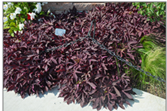
Sweet Caroline Red Hawk Sweet Potato Vine