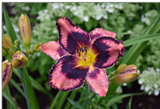
Rainbow Rhythm Storm Shelter Daylily flowers