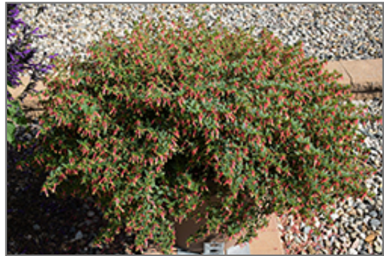
Honeybells Cuphea in bloom