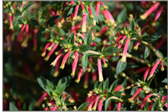
Honeybells Cuphea flowers

Honeybells Cuphea is recommended for the following landscape applications;