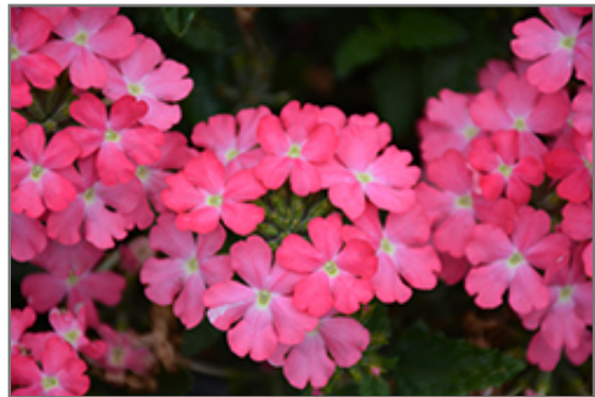
Firehouse Pink Verbena flowers