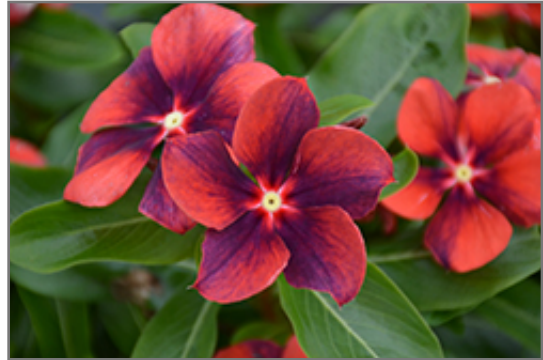
Tattoo Tangerine Vinca flowers

This plant will require occasional maintenance and upkeep, and should not require much pruning, except when necessary, such as to remove dieback. It is a good choice for attracting butterflies to your yard, but is not particularly attractive to deer who tend to leave it alone in favor of tastier treats. It has no significant negative characteristics.