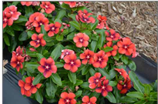
Tattoo Tangerine Vinca in bloom