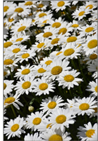
Becky Shasta Daisy flowers