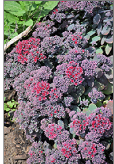
Rock 'N Grow Superstar Stonecrop flower buds

Rock 'N Grow Superstar Stonecrop is a dense herbaceous perennial with a mounded form. Its medium texture blends into the garden, but can always be balanced by a couple of finer or coarser plants for an effective composition.