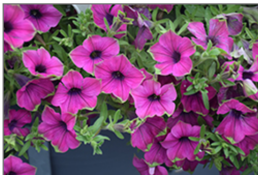
Supertunia Picasso In Purple Petunia flowers