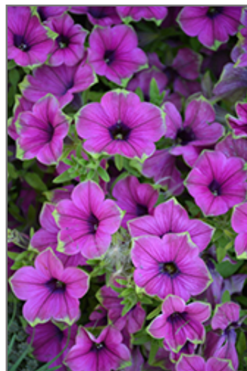
Supertunia Picasso In Purple Petunia flowers

Supertunia Picasso In Purple Petunia is a dense herbaceous annual with a trailing habit of growth, eventually spilling over the edges of hanging baskets and containers. Its medium texture blends into the garden, but can always be balanced by a couple of finer or coarser plants for an effective composition.