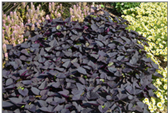
Sweet Caroline Sweetheart Jet Black Sweet Potato Vine

Sweet Caroline Sweetheart Jet Black Sweet Potato Vine is recommended for the following landscape applications;