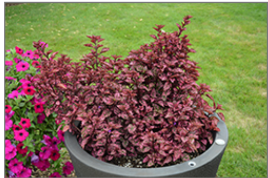
Hippo Rose Polka Dot Plant