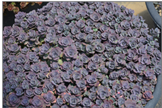
SunSparkler Blue Elf Sedoro