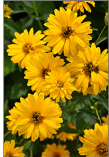
Summer Sun False Sunflower flowers

Summer Sun False Sunflower is recommended for the following landscape applications;