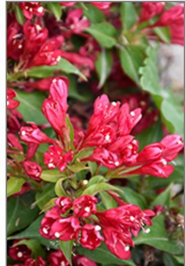
Crimson Kisses Weigela flowers