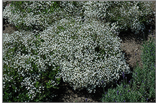
Summer Sparkles Baby's Breath in bloom

This plant should only be grown in full sunlight. It prefers dry to average moisture levels with very well-drained soil, and will often die in standing water. It is considered to be drought-tolerant, and thus makes an ideal choice for a low-water garden or xeriscape application. It is not particular as to soil type, but has a definite preference for alkaline soils, and is able to handle environmental salt. It is highly tolerant of urban pollution and will even thrive in inner city environments. This is a selected variety of a species not originally from North America.