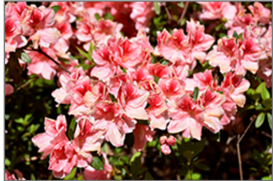
Gloria Azalea flowers