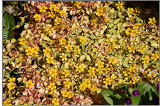
Molten Lava Shamrock in bloom