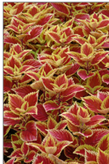
Trusty Rusty Coleus foliage