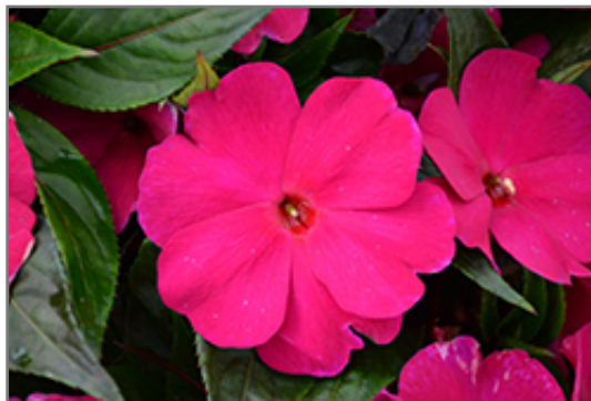
Magnum Purple New Guinea Impatiens flowers

Magnum Purple New Guinea Impatiens is recommended for the following landscape applications;