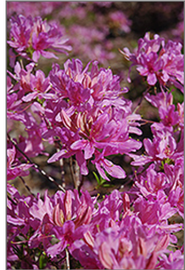
Orchid Lights Azalea flowers