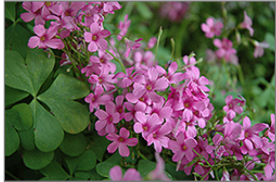
Pink Wood Sorrel flowers