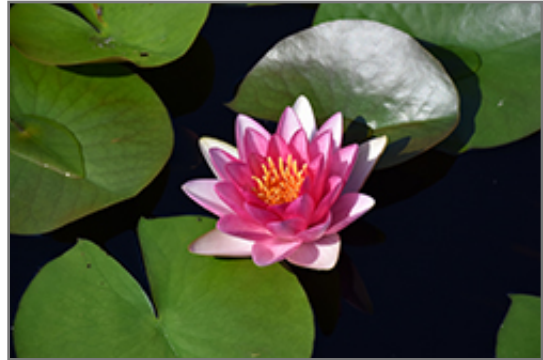
Attraction Hardy Water Lily flowers