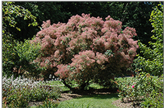
Grace Smokebush in bloom

Grace Smokebush is recommended for the following landscape applications;