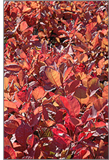
Grace Smokebush in fall

This shrub should only be grown in full sunlight. It is very adaptable to both dry and moist locations, and should do just fine under average home landscape conditions. It is not particular as to soil type or pH. It is highly tolerant of urban pollution and will even thrive in inner city environments, and will benefit from being planted in a relatively sheltered location. This particular variety is an interspecific hybrid.