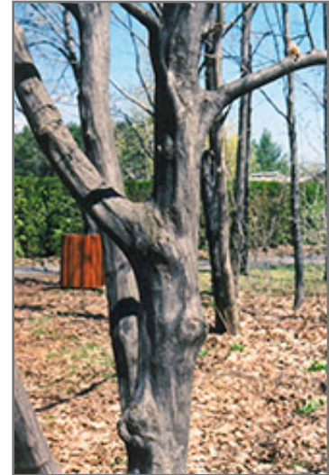
American Hornbeam bark

This tree performs well in both full sun and full shade. It is an amazingly adaptable plant, tolerating both dry conditions and even some standing water. It is not particular as to soil type or pH. It is somewhat tolerant of urban pollution. This species is native to parts of North America.