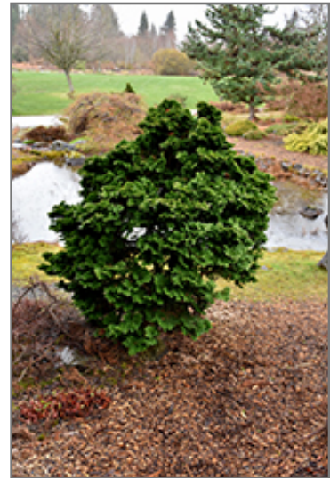
Dwarf Hinoki Falsecypress