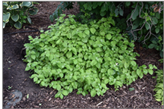
Arctic Sun Dogwood