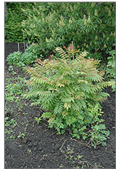
Sem False Spirea