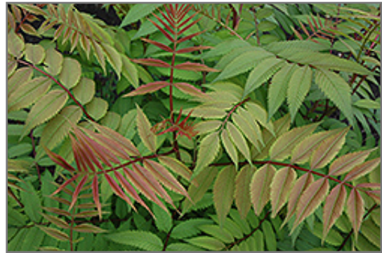
Sem False Spirea foliage