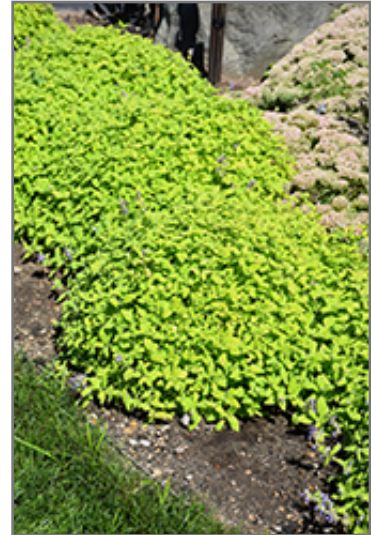
Chartreuse On The Loose Catmint