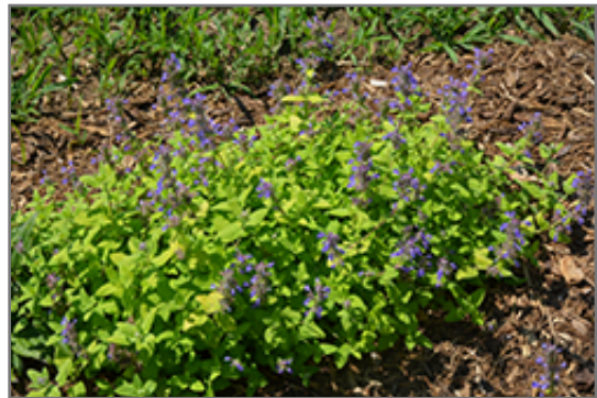
Chartreuse On The Loose Catmint in bloom

8020 N. SHADE TREE DRIVE PEORIA, IL 61615