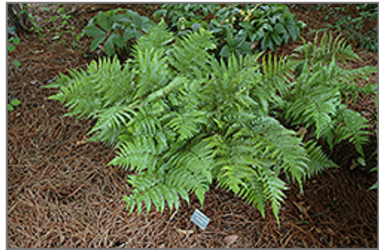
Autumn Fern

Autumn Fern will grow to be about 18 inches tall at maturity, with a spread of 18 inches. Its foliage tends to remain dense right to the ground, not requiring facer plants in front. It grows at a medium rate, and under ideal conditions can be expected to live for approximately 15 years. As an evergreen perennial, this plant will typically keep its form and foliage year-round.