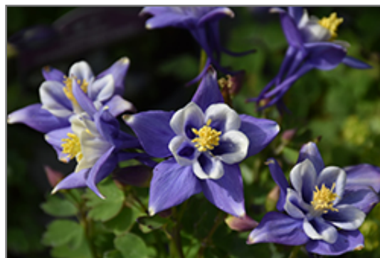
Earlybird Blue and White Columbine flowers