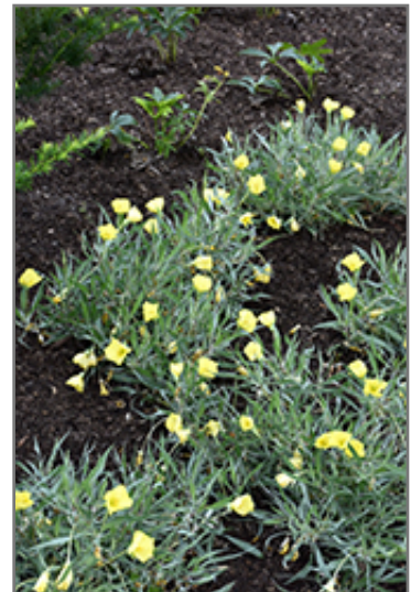
Evening Sun Primrose in bloom