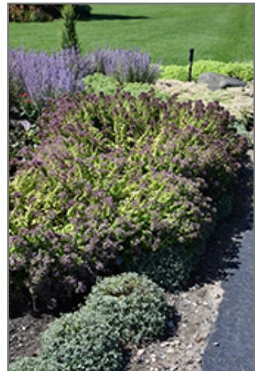
Drops of Jupiter Oregano in bloom