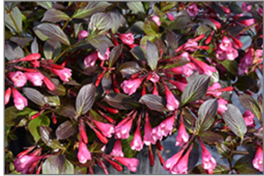
Very Fine Wine Weigela flowers