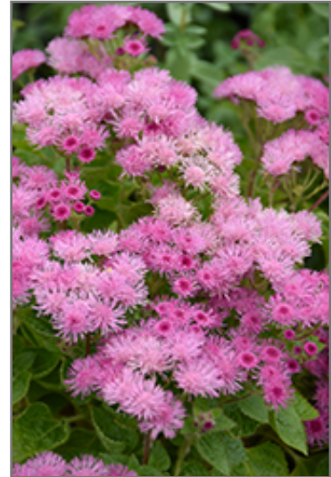
Bumble Rose Flossflower flowers

Bumble Rose Flossflower is recommended for the following landscape applications;