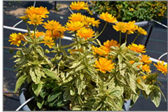
Bit Of Honey False Sunflower in bloom

Bit Of Honey False Sunflower will grow to be about 20 inches tall at maturity, with a spread of 3 feet. When grown in masses or used as a bedding plant, individual plants should be spaced approximately 30 inches apart. Its foliage tends to remain dense right to the ground, not requiring facer plants in front. It grows at a fast rate, and under ideal conditions can be expected to live for approximately 10 years. As an herbaceous perennial, this plant will usually die back to the crown each winter, and will regrow from the base each spring. Be careful not to disturb the crown in late winter when it may not be readily seen!