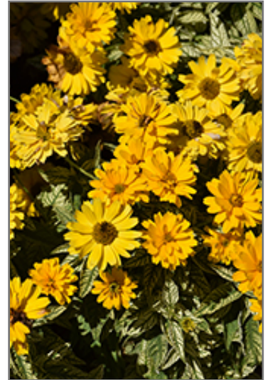
Bit Of Honey False Sunflower flowers

This is a relatively low maintenance plant, and is best cleaned up in early spring before it resumes active growth for the season. It is a good choice for attracting butterflies to your yard. It has no significant negative characteristics.