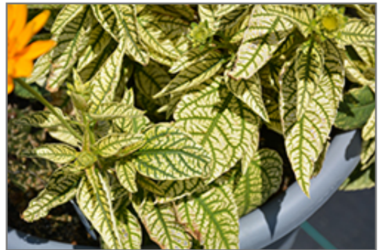
Bit Of Honey False Sunflower foliage