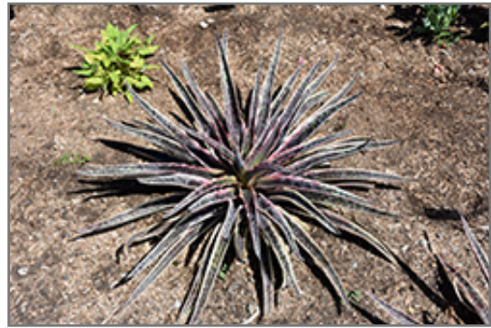
Art Deco Mangave